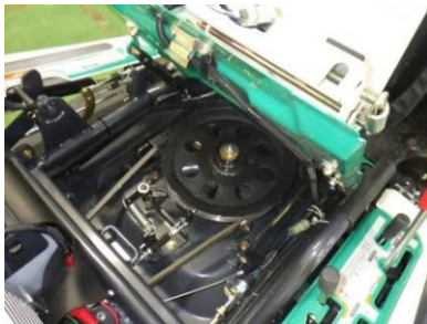
Rotary Cover Uper part