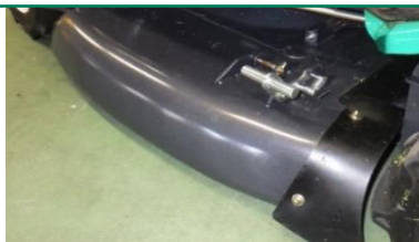
During right cover down