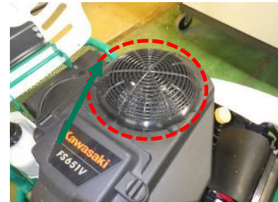
Engine Cooling Air