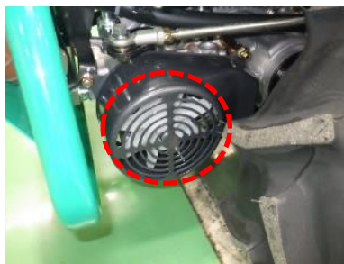
HST Cooling Air Intake